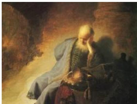
Prophet Jeremiah by Rembrandt